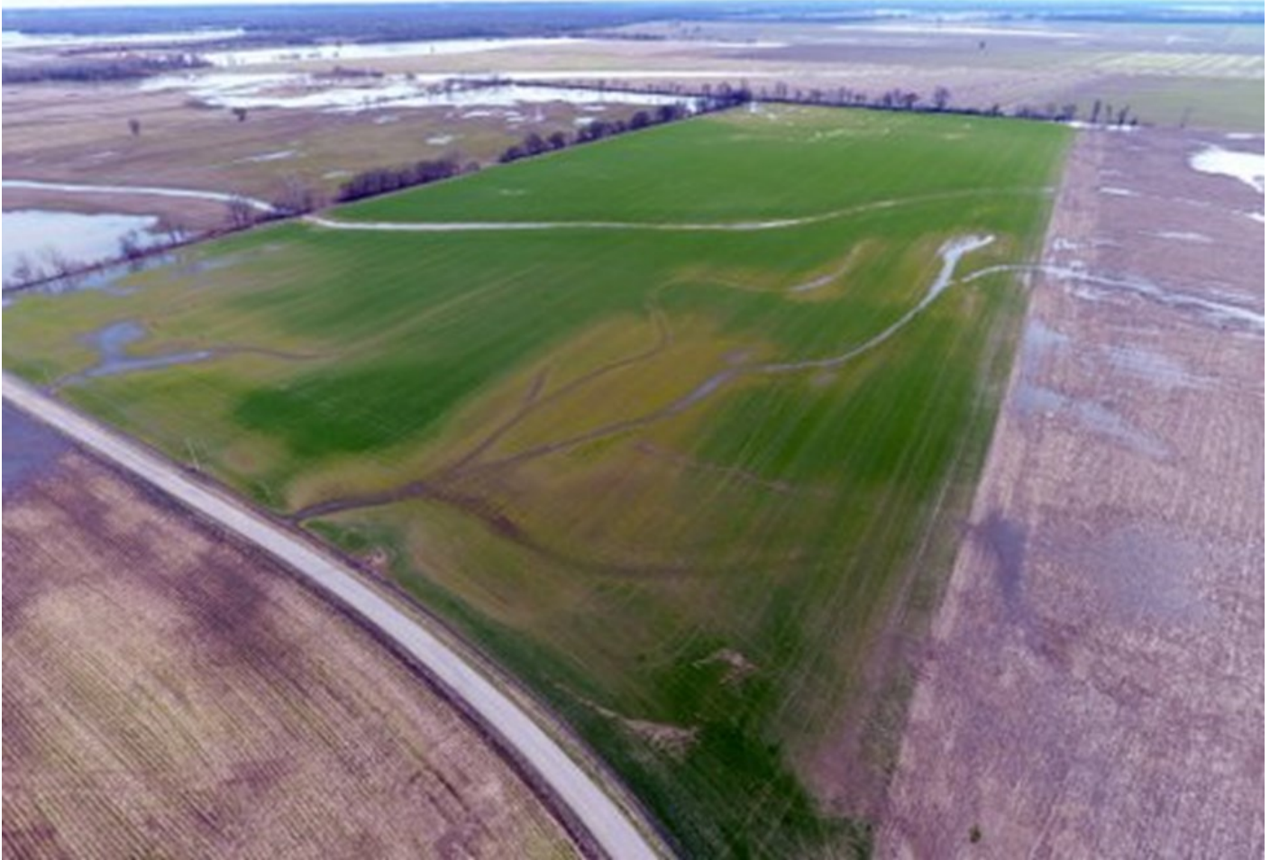
Figure 1. Wheat field in Fulton County with significantly saturated soils.

Unfortunately, it does not appear that Kentucky's wheat condition has improved much within the last month. Much of the crop has been subjected to considerable water stress (Figure 1). This is due to unusually wet conditions from January to date (March 6). Western Kentucky has received on average 14.5" precipitation since January, which is almost 6" more than the 30-year average. Similarly, Central Kentucky has received 12.8", about 5.5" more than the 30-year average.