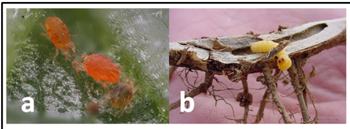
Figure 1. (a) Overwintering forms (bright red-orange color) of the two-spotted spider mite, and (b) Fourth instar Dectes larva in a sheltered tunnel in the lower soybean stem.