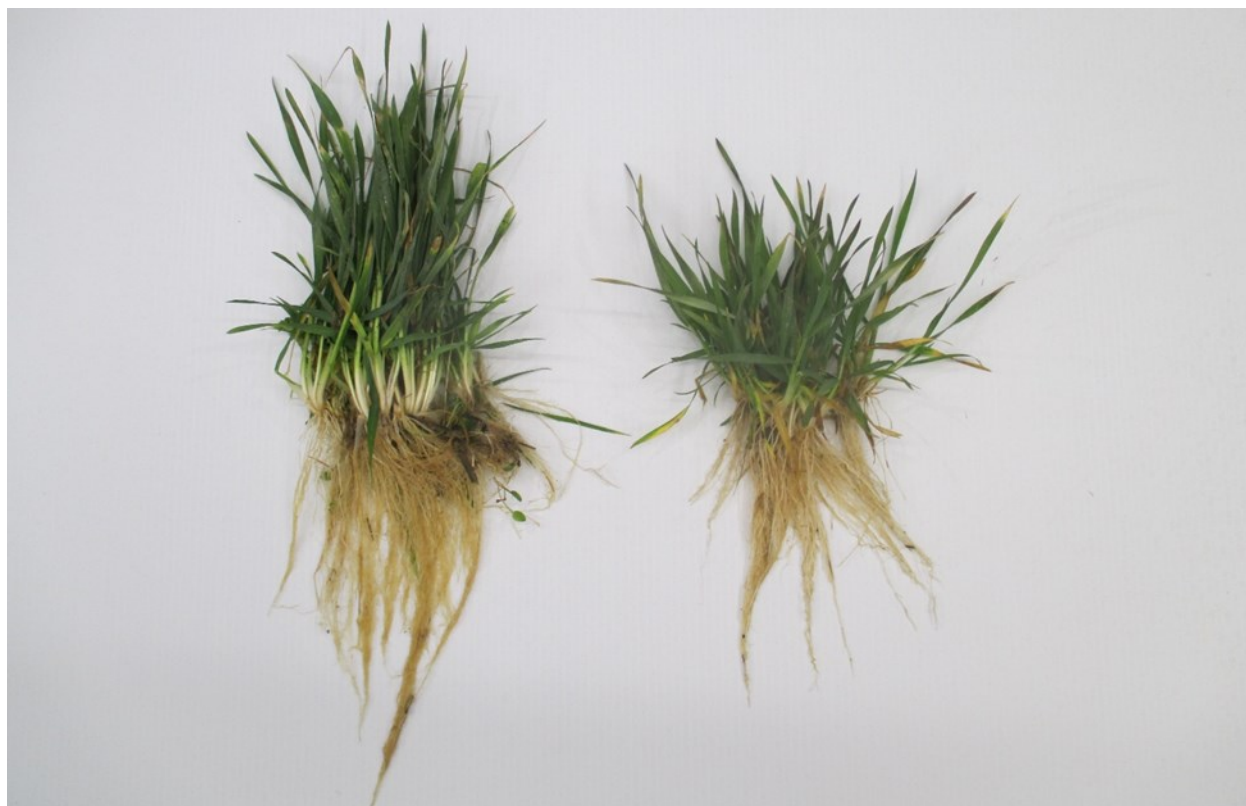
Figure 2. Wheat roots from plants that were planted in early October on a well-drained Crider silt loam soil (Left) and a moderately-drained Zanesville silt loam soil (Right) at Princeton, KY. Roots are approximately 5" long for the wheat plants on the left and 3" long for the wheat plants on the right.

If further deterioration of the wheat crop occurs, producers may have to make a very difficult decision: Should the wheat crop continue or should another crop be planted?