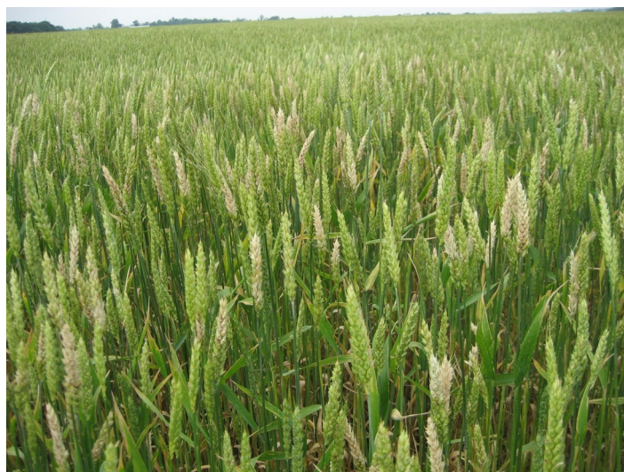
FUSARIUM HEAD BLIGHT (SCAB) SYMPTOMS IN WHEAT

proper time can dramatically minimize damage. Although foliar fungicides are great tools that can be used to help reduce scab, susceptible varieties will still be affected severely in years that are favorable for scab, despite the application of a foliar fungicide. Though multiple characteristics need to be considered, variety selection is widely recognized as the simplest and most cost effective way to maximize production profitability. The University of Kentucky wheat variety performance data is available online at http://www.uky.edu/Ag/wheatvarietytest/ . Although head scab ratings were not taken due to very low pressure in 2015, good data was collected for leaf blotch. Head scab ratings are available in the 2013 & 2014 reports. Growers can also check the 2015 variety report from the University of Illinois ( http://vt.cropsci.illinois.edu/wheat.html ), where head scab pressure was very high.