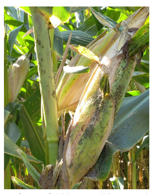
Figure 1. Severe infestation of Bird cherry oat aphids in a research plot in corn at the UK's Research and Education Center in Princeton by the end of August in 2018

Small grains are not planted during the summer in KY however, bird cherry oat and English aphids are present in alternative hosts. Bird cherry oat aphids in North America are hosted by the common choke-cherry ( Prunus virginiana ); whereas English aphids is hosted by several volunteer small-grains and weedy grass species such as rough barnyard grass, yellow foxtail, and green foxtail. Also, these two aphid species can be found in field corn (Figure 1) and millet planted in the summer.