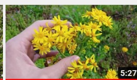
Weekly Weed Watch: Cressleaf Groundsel