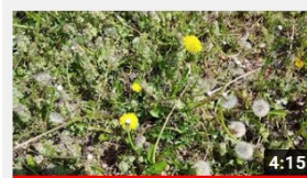
Weekly Weed Watch: Dandelion

The video series has featured weeds such as annual ryegrass, marestalk, henbit, purple deadnettle, wild garlic, and cressleaf groundsel so far. Current plans are to release one video per week through June.