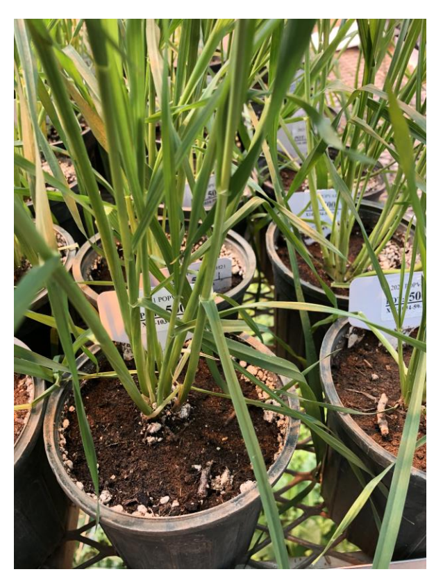
Figure 3. Wheat plants in greenhouse for crossing.

Line development : F_4 and F_5 headrows at Lexington came through the winter in good shape and produced a decent amount of seed that will allow us to test their progeny in plots this fall. About 780 rows were selected based on plant height, clean leaves and heads, and overall vigor as well as maturity. These lines will go into trials this fall at up to 3 locations. These lines have been genotyped so we used genomic predictions as well as overall vigor, height, maturity and clean leaves to make our selections.