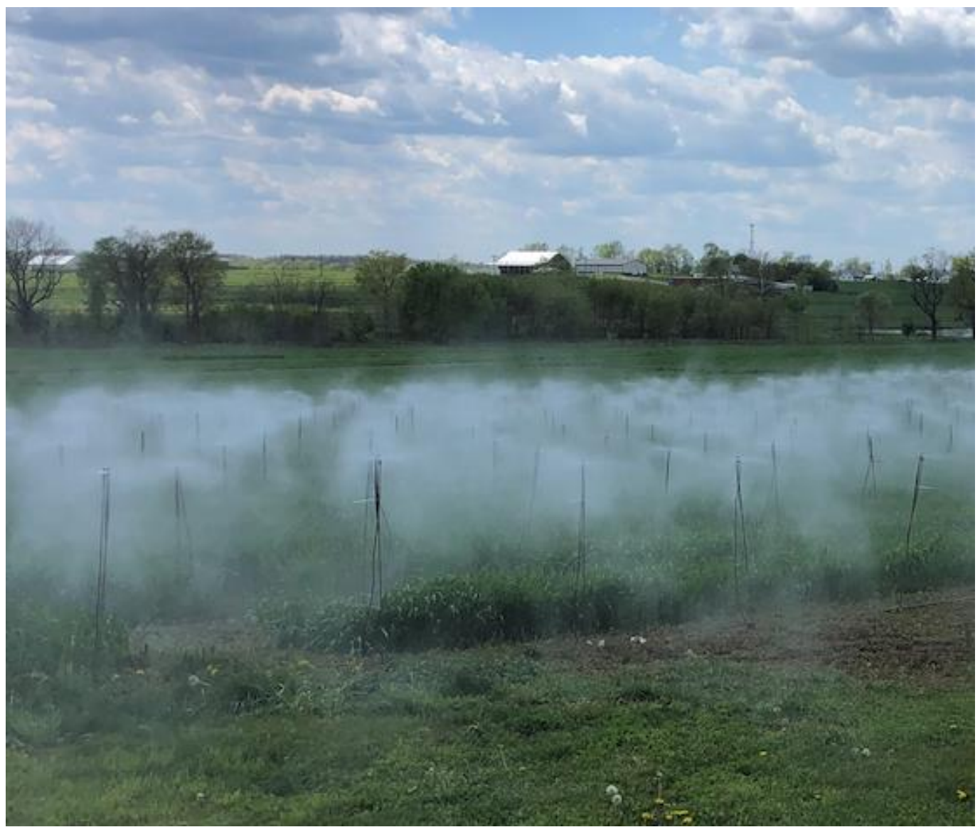
Figure 4. Irrigated, Inoculated Scab Nursery, Lexington, KY 2021.

Speed Breeding : We acquired more high intensity LED lights this year and put them in the greenhouse to increase our speed-breeding effort. We planted one cycle of material that came out of speed breeding in the field adjacent to the greenhouse and got modest amounts of seed back, enough to go into mini-plots this fall. The whole objective here is to reduce the number of years required to develop a variety.